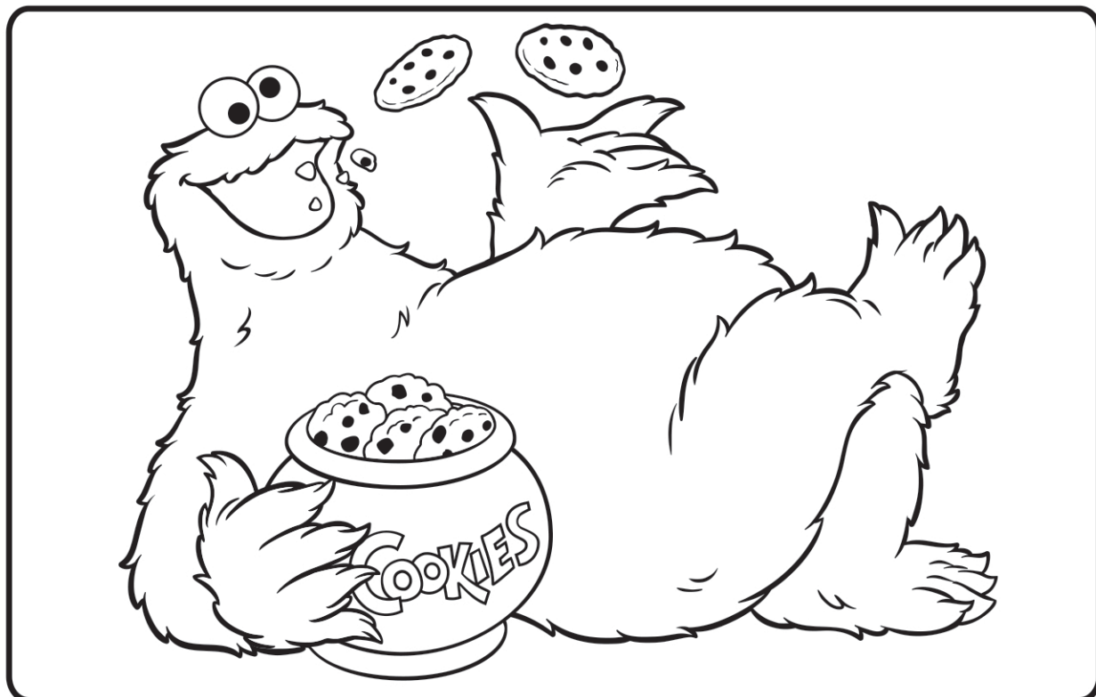
Illustration by Sesame Workshop